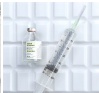
Digital images capture the actual volume used for preparation