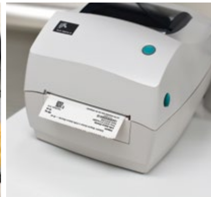
Individual labels print when doses are prepared