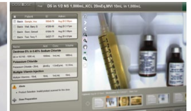
Zoom in on high-resolution images taken during dose preparation, including the steps used to reconstitute vials