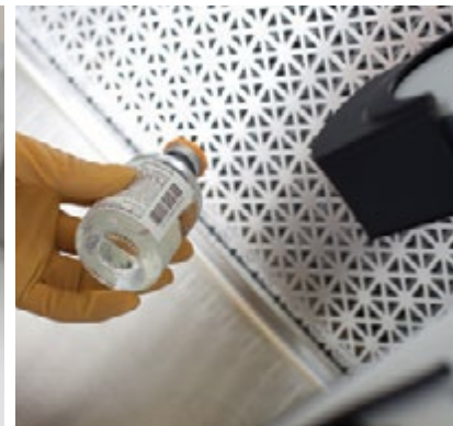
Product labels are scanned to confirm correct drug selection