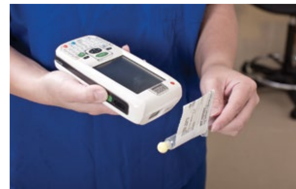
Barcode-enabled dose tracking provides continuous visibility to status and location of doses

Since its inception, the DoseEdge System has processed over 25 million doses and identified more than 1.3 million potential errors. To find out how, view the demonstration videos on the Baxter Pharmacy Operations YouTube channel at youtube.com/baxterpharmacyops .