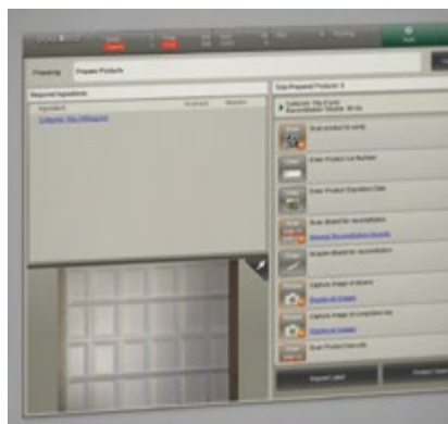
Detailed preparation instructions facilitate standardized processes