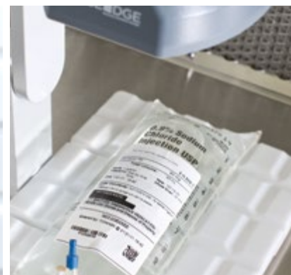
Final image captures completed dose, ready for pharmacist check