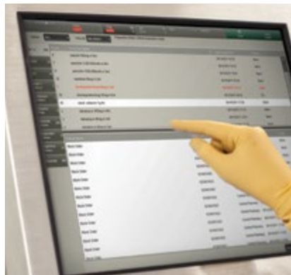
Electronic dose queue allows users to identify orders by type and urgency